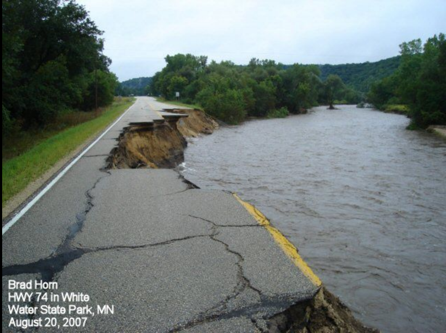
Brad Horn HWY 74 in White Water State Park, MN August 20, 2007